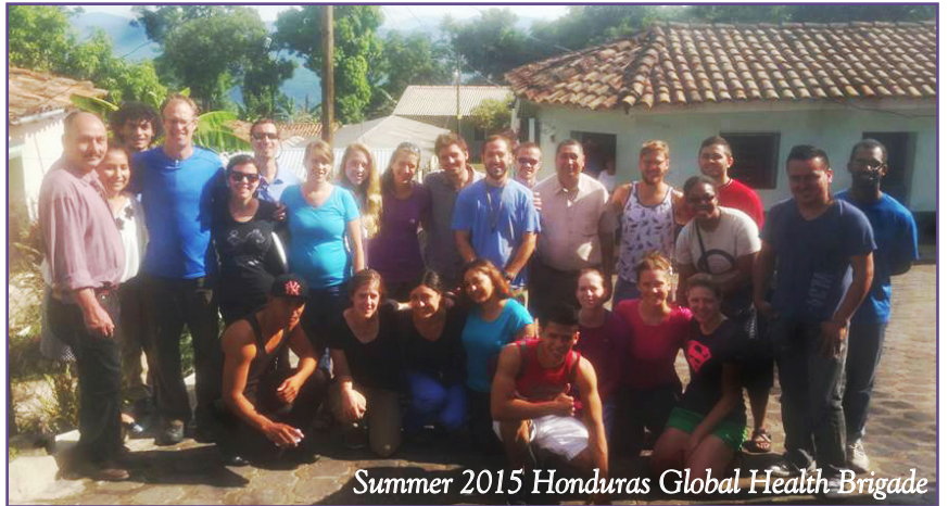
Summer 2015 Honduras Global Health Brigade

Continuing MAHEC's longtime collaboration with the non-profit development organization Shoulder to Shoulder and the community of Camasca, Honduras, the group set up mobile medical clinics providing primary care consultations to over 1,000 patients in ten villages. Brigade members also provided eyeglasses, screened patients for depression, visited homebound patients, taught students about sexual health, distributed water filters with community health workers, and covered OB night shifts in the local clinic delivering six healthy babies during their two-week stay!