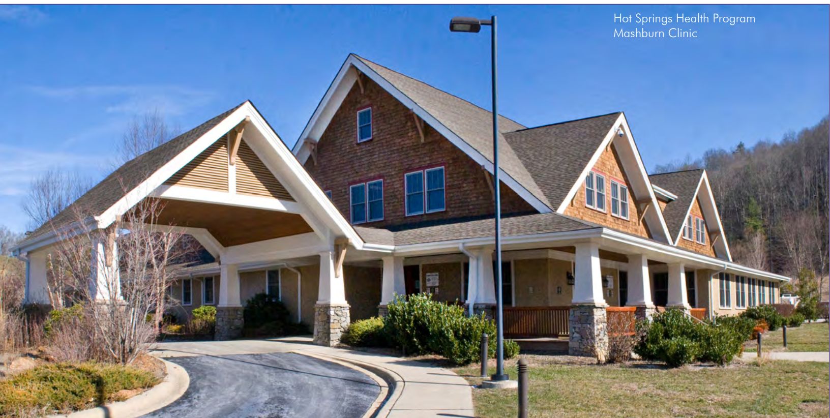
Hot Springs Health Program Mashburn Clinic