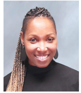
Leslie Council Lake, CPLC