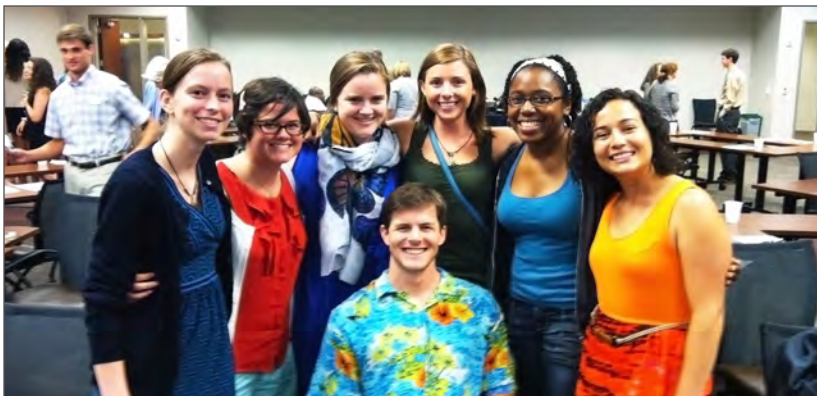
Students in the 2013 Rural and Underserved Scholars Program