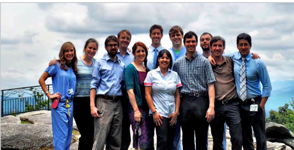
Hendersonville residents at Jump Off Rock in Henderson County